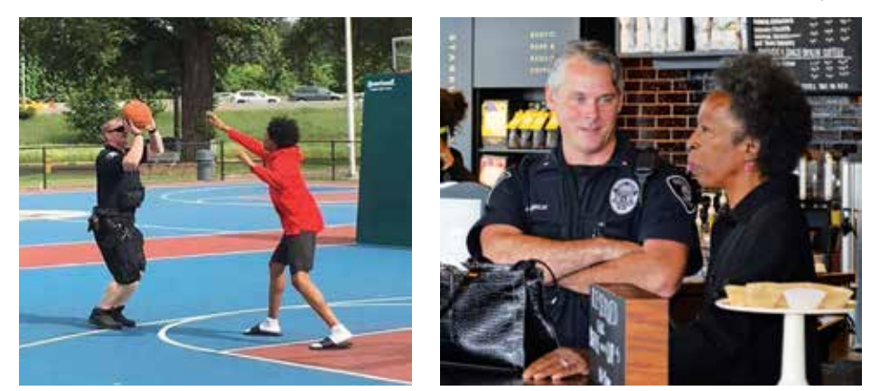
A little impromptu 1-on-1 basketball and "Coffee with a Cop" are two ways Renton police connect with the community.

The next time you see a Renton police officer they might be shooting hoops or holding a Q&A session at a local church. These sightings are all part of the department's efforts to get out of their patrol cars and into the community.